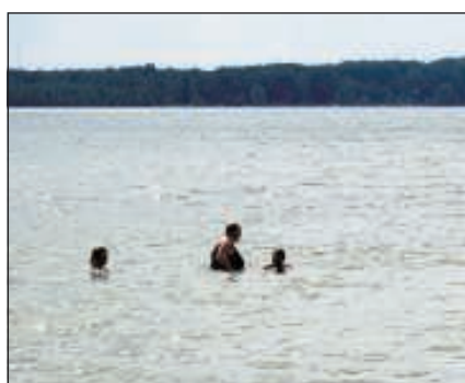
Roughly half of Round Lake was covered in Eurasian watermilfoil in 2007 before treatments arranged by the Round Lake Improvement Board.

Swimmers enjoy Round Lake at the Sheridan Township Park beach earlier this week. No surface weeds are visible on the lake, but native submerged weeds are still present.