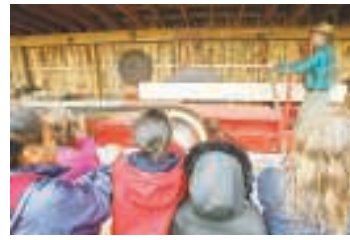
It's Lumbering Days at While Pine Village this weekend.